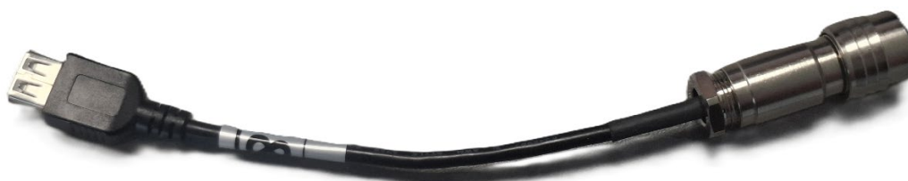
Figure 2: Firmware update USB cable for peristaltic pump